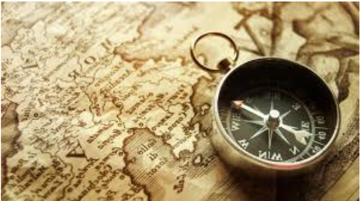
A Round of the 2017 HRA Resto Country Spares Standard Car Challenge. A round of the HRA Touring Championship