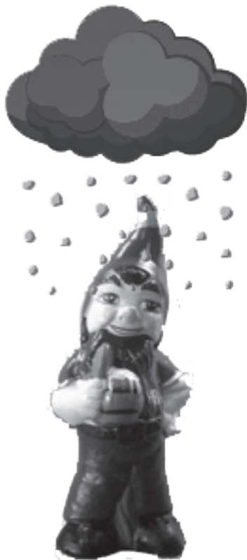
The HRA Gnome is hail damaged. It's hailing