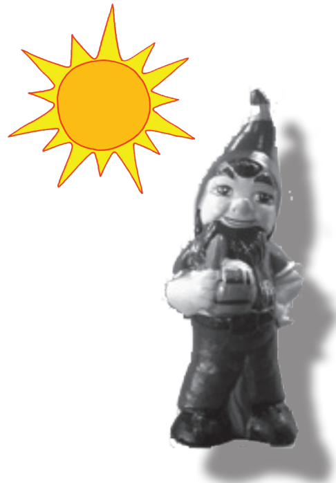
The HRA Gnome is dry. It's sunny. It may rain soon