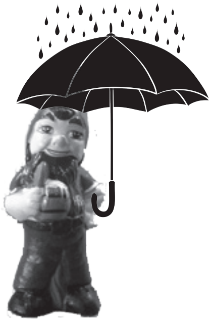
The HRA Gnome is wet. It's raining.