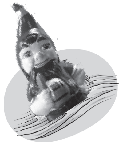
The HRA Gnome half under water and listing to starboard. It's raining a lot. Really a lot.